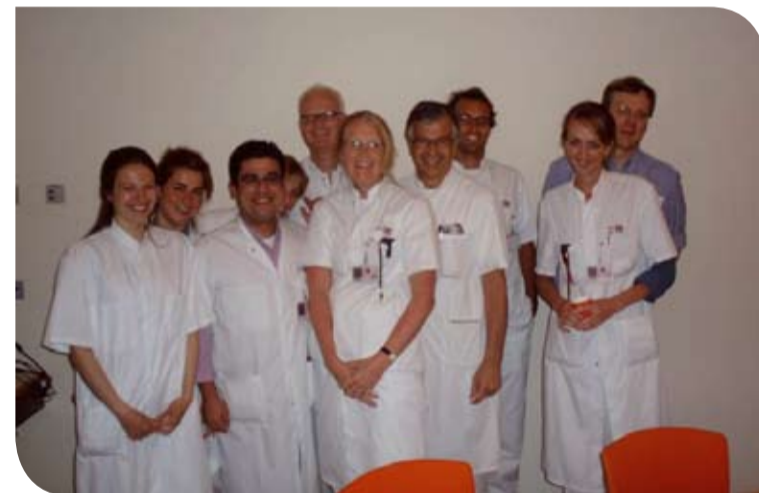
Friendly staff at AMC in Amsterdam

I wish that other residents will find the inspiration and the chance to have a similar journey. Residency is tough for everybody and residents have very little free time. But as I have experienced there is the chance to broaden one's outlook, learn from the experience of other people, consider other ideas and know how various people deal with or solve the everyday problems in this wonderful specialty of urology.