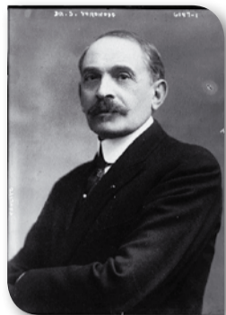
Fig. 1: Serge Voronoff

...The Russian Sergei Voronoff (1866-1951) (Fig.1) was a great advocate of rejuvenation and was the first to perform human xenotransplants. He transplanted testicular tissue from a monkey into a human reproductive gland in 1920.