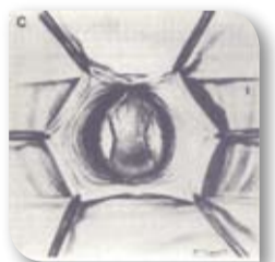
Fig. 2: Voronoff's technique of transplanting slices of monkey donor glans into the patient's testis (from: Herrmann JR,1982)

...In five years he has operated more than 300 patients from all over the world. His method became so popular that the French Government forbid monkey hunting in the French colonies. This prompted Voronoff to build his own monkey house in Menton.